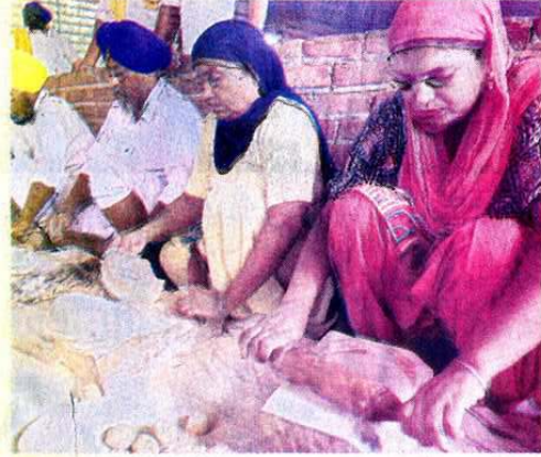
श्री हरिमंदिर साहिब, अमृतसर में बाढ़ पीड़ितों के लिए लंगर बनाती महिलाएं।