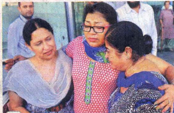
श्रीनगर में बाढ़ में फंसी महिला अमृतसर आने पर अपनों से गले मिलकर खुशी मनाती।

एसजीपीसी की ओर लगातार जम्मू कश्मीर के बाढ़ प्रभावित लोगों को राहत सामग्री पहुंचाई जा रही थी। एसजीपीसी की कार्यकारिणी के निर्देशों पर बाढ़ प्रभावित को सुरक्षित अमृतसर पहुंचाने फैसला लिया गया है। जिनके पास पंजाब आने के लिए कोई साधन नहीं हैं उनको हवाई सेवा की सहायता से सुरक्षित अमृतसर पहुंचाने की कोशिश एसजीपीसी की ओर से की जा रही है। इन तीन पीड़ितों को स्पाइस जेट एयरवेज के माध्यम से अमृतसर लाया गया है। एयरलाइन की ओर से इस काम के लिए एसजीपीसी को तीस टिकटें दी गई थीं। सुरक्षित