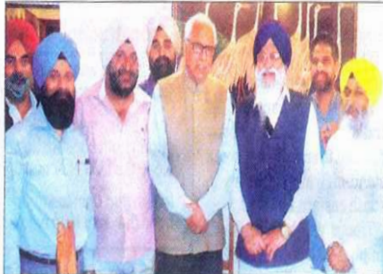
SGPC delegation meets J&K Governor NN Vohra (fourth from right) in Srinagar.

Makkar returned to Punjab today after a two-day visit to J&K. The Governor gave the SGPC delegation a patient hearing and assured them of all help to the flood-affected members of the community. The J&K Chief Minister and the Governor