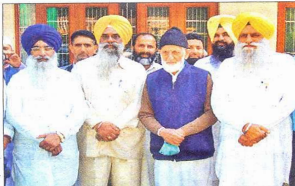
All Parties Hurriyat Conference chairman Syed Ali Shah Geelani during a meeting with an SGPC delegation in Srinagar.