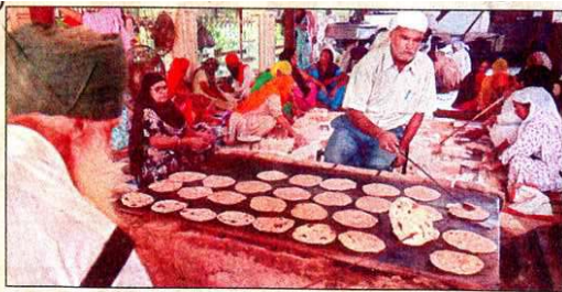
श्री हरिमंदिर साहिब, अमृतसर के लंगर हाल में पीड़ितों के लिए तैयार होता लंगर।