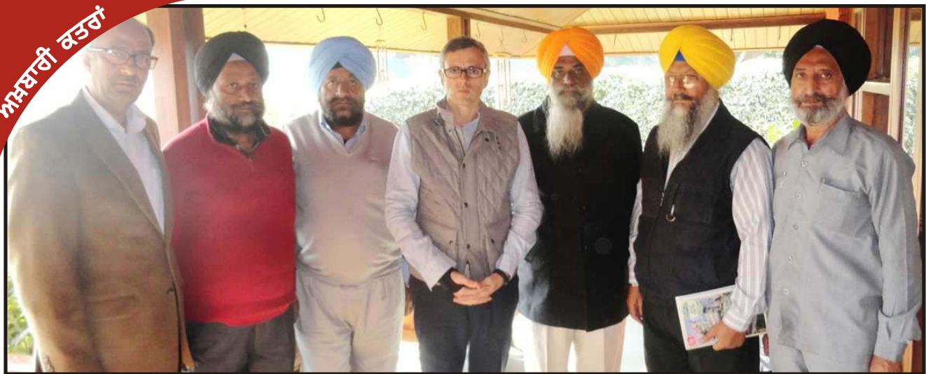
SGPC officials with J&K CM Omar Abdullah in Srinagar.