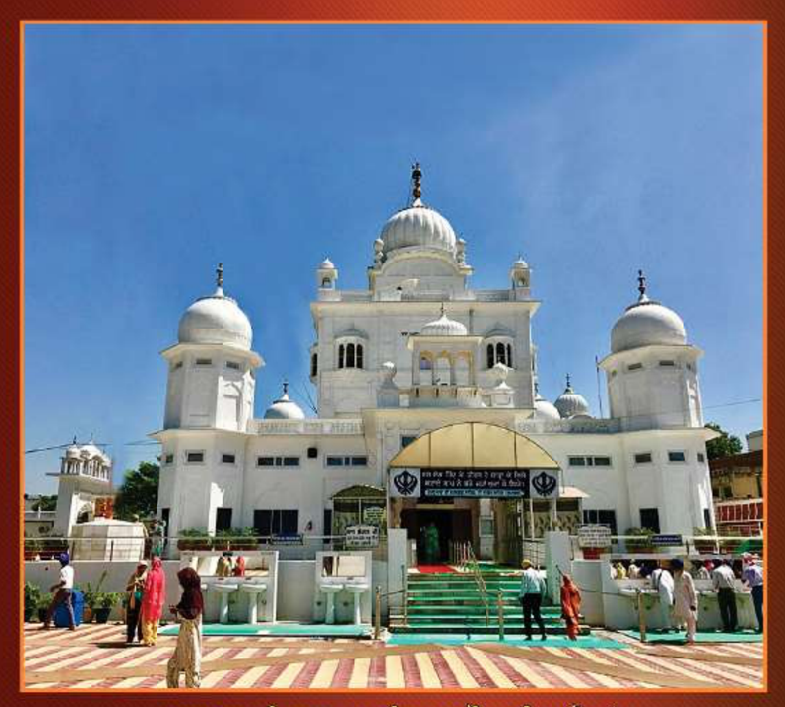
ਗੁਰਦੁਆਰਾ ਸ੍ਰੀ ਕਤਲਗੜ੍ਹ ਸਾਹਿਬ, ਚਮਕੌਰ ਸਾਹਿਬ (ਰੋਪੜ)

Shiromani Gurdwara Parbandhak Committee, Sri Amritsar, 🔏